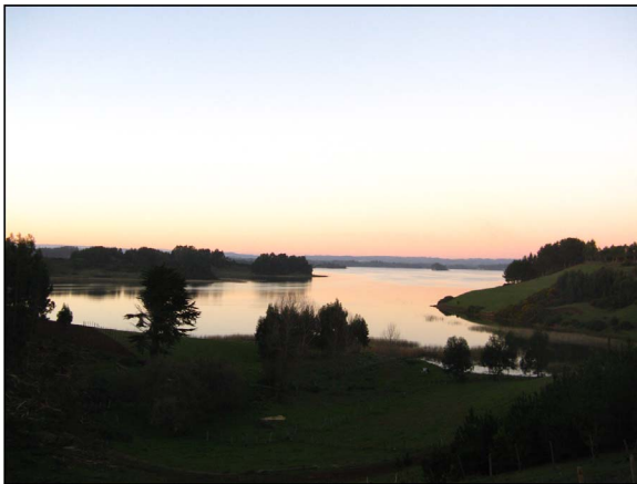
Picture 1. Lake Budi from ground level.

ers with a Mapuche-Lafkenche indigenous community in the Budi Lake that was impacted by the 1960 Valdivia earthquake, our investigation was guided by the following overarching question: